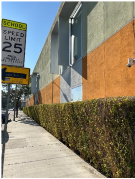
Building B Exterior

The street sides are included to be repainted