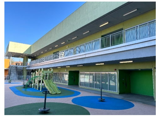
Building B Exterior

The awnings and windows will be protected