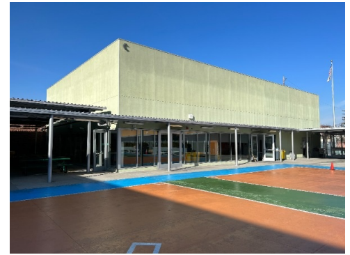
Building C Exterior

The stucco will be prepped and repainted here