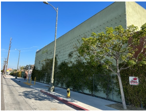
Building C Exterior

We will paint around the landscaping as best as possible