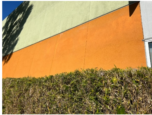
Building B Exterior