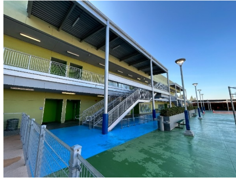
Building B Exterior

The stucco soffits are included to be painted