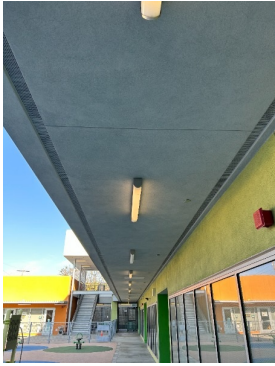
Building B Exterior

View of the exterior stucco walls to be prepped and repainted