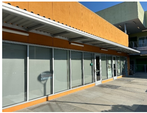
Building A Exterior

The stucco siding will be prepped and repainted