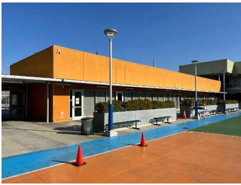
Building A Exterior

The stucco siding will be prepped and repainted